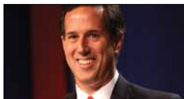
Rick Santorum 3