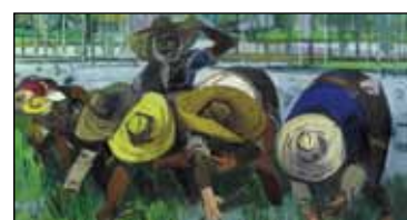
Donne d'Italia 8