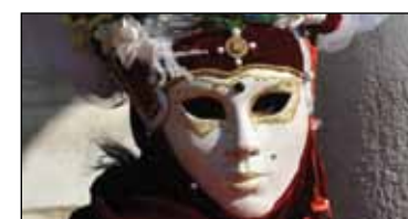
Carnival in Venice 11