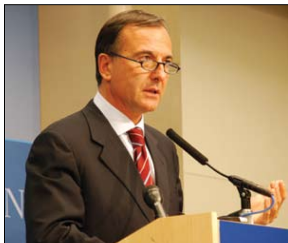
Frattini addresses a Brookings Institution audience.

Franco Frattini, Italy's Minister of Foreign Affairs, addressed a group at the